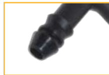
Double Barbed (Air, vapor or fuel)