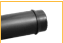
Single Barb (Air)